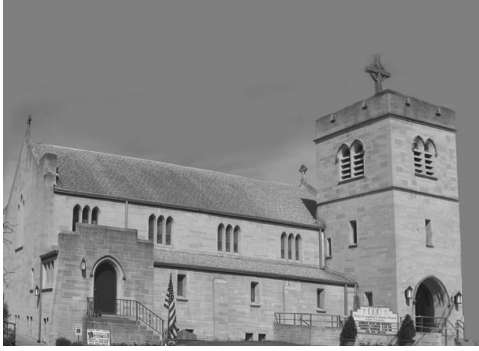
TRINITY EVANGELICAL LUTHERAN CHURCH 323 Fifth Street, Freeport, PA 16229